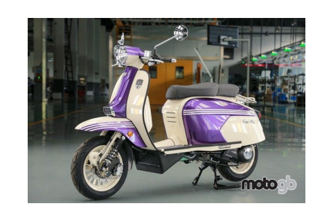
More colours available